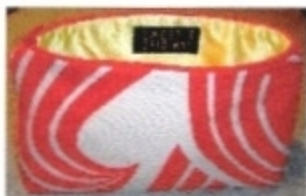
Tribal by Marimekko $23 (approx 12.00) made from the 2000 Marimekko Tsunami fabric