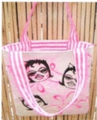
Superstar Tote Bag $35 (approx £18.50) original screen print by California-based artist Jeff Claassen.

So maybe, we can revive some of that Sex and the City glamour with the help of New York bag designer Tanja Koch of Sweet T Original.