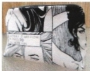
Hollywood 50s glamour makeup bags $20 (approx £10.50)

The duvets were pulled over our heads, blinds down, we even forgot to cleanse, tone and moisturise. Yes, it was truly a day of mourning when Carrie Bradshaw skipped through New York with Mr Big and left her style protégées numb, nil and void.